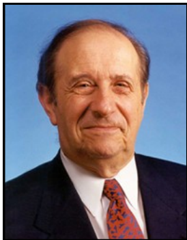
Dr. Stanley Plotkin

The third annual Vaccine Day will be held on October 29, 2010 at the Johns Hopkins Bloomberg School of Public Health. JHVI is pleased to announce that Dr. Stanley Plotkin, emeritus Professor of Pediatrics at the University of Pennsylvania and former Scientific Director at Aventis-Pasteur, will deliver the keynote address.