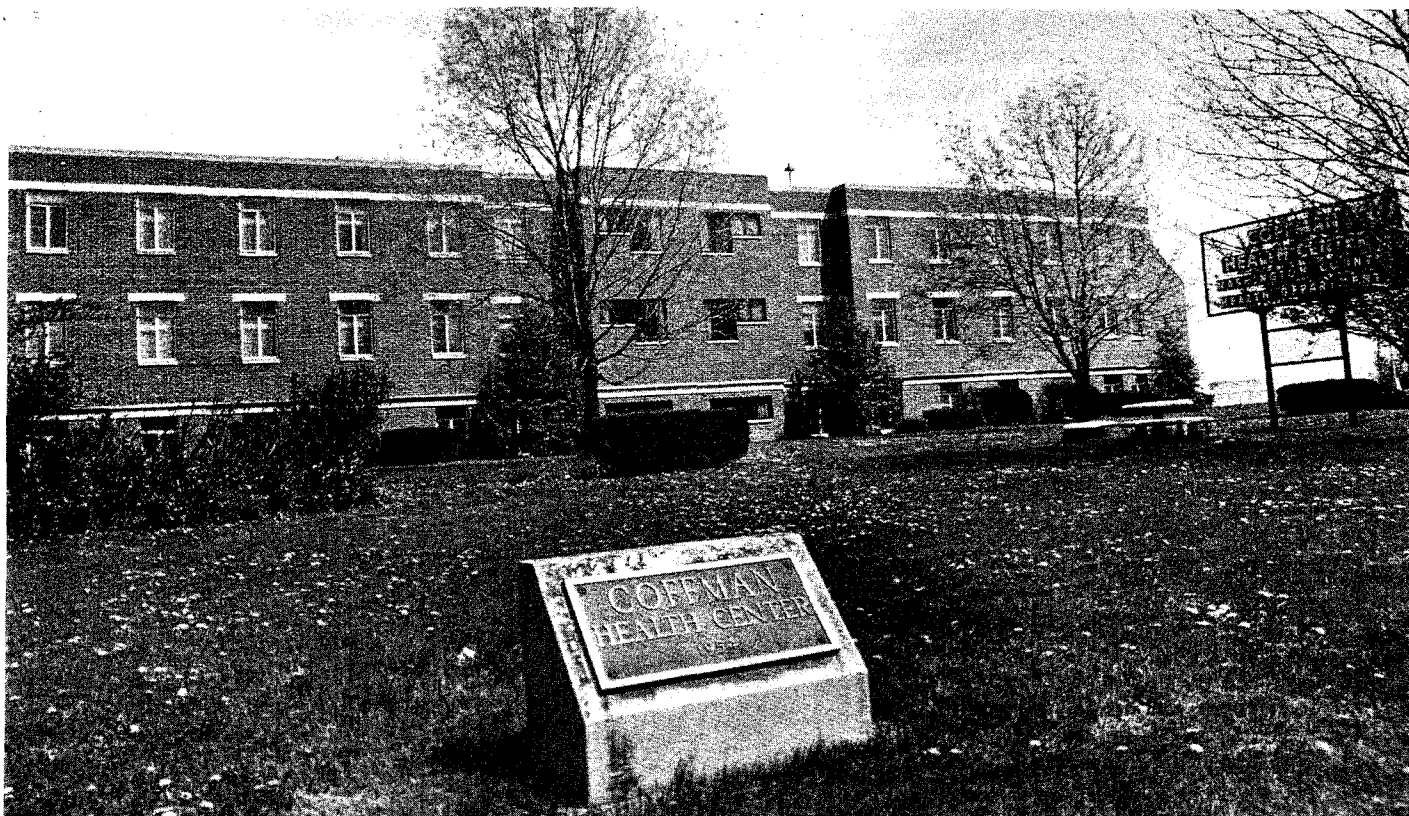
Today the two Coffman-built public health department buildings have been joined together by a government building program that also added a modern new offices/laboratories wing (see photo on front cover). A lasting monument to the philanthropy of Gladys and Andy Coffman.

losis screening is conducted in schools and industries in cooperation with the Health Department, begun in 1912, is still being adhered to.