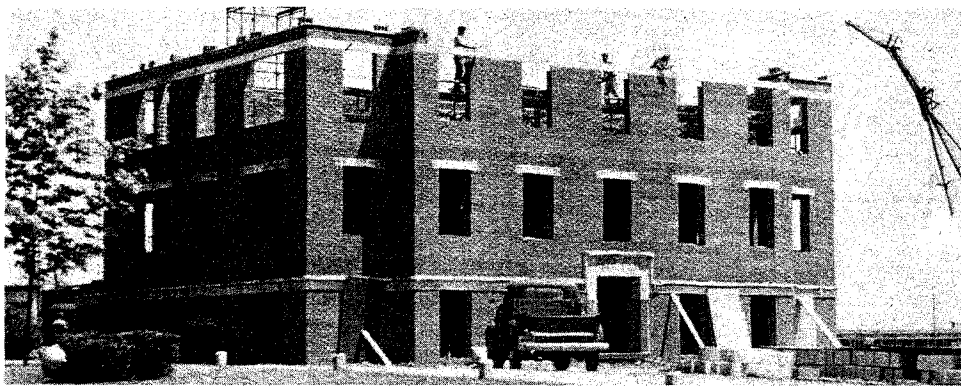
Coffman Research Center was built in 1958.

foreign countries were developed through the series of Hagerstown studies.