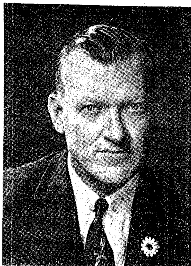
HON. THEODORE R. MCKELDIN