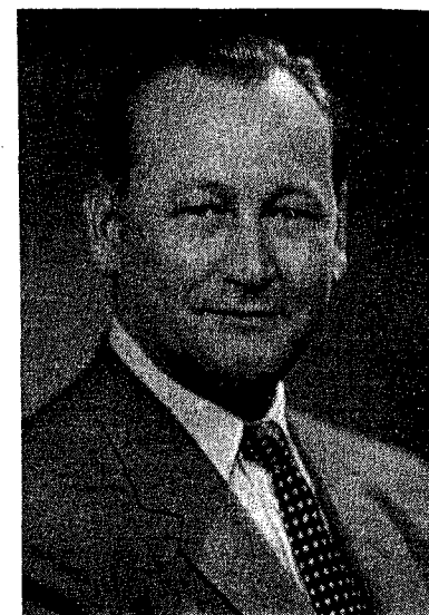
HON. WINSLOW F. BURHANS