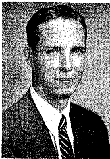
LEROY E. BURNEY, M.D. Surgeon General, United States Public Health Service