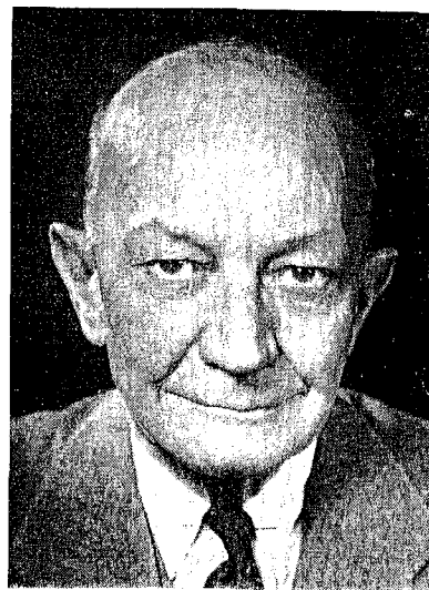
HON. WILLIAM PRESTON LANE, JR.