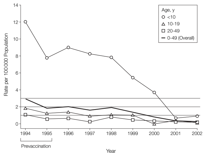
Figure 1. Varicella-Related Hospitalization Rates, 1994-2002

Varicella was the primary diagnosis code for data shown.