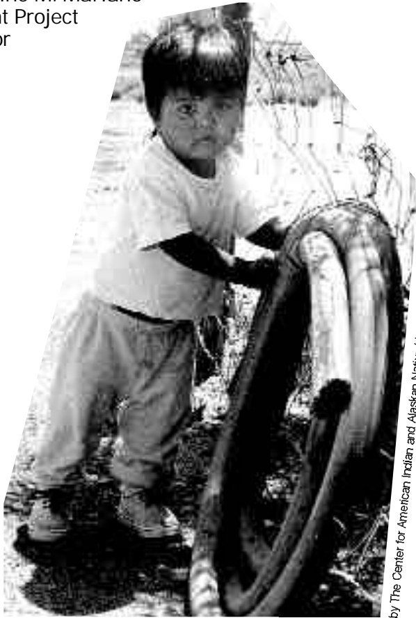
by The Center for American Indian and Alaskan Native Health