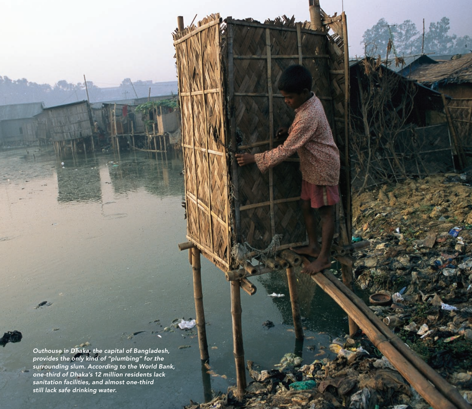
Outhouse in Dhaka, the capital of Bangladesh, provides the only kind of “plumbing” for the surrounding slum. According to the World Bank, one-third of Dhaka’s 12 million residents lack sanitation facilities, and almost one-third still lack safe drinking water.