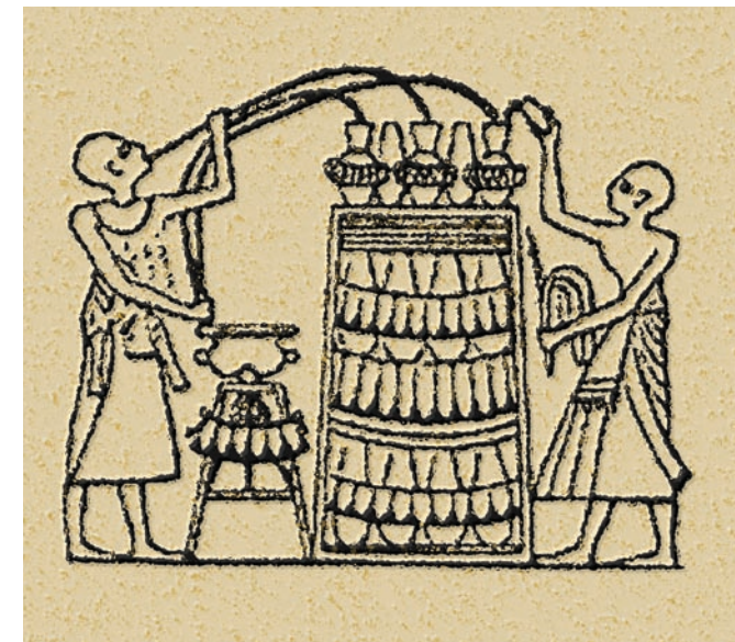
Drawing copied from the wall of an Egyptian pharaoh's tomb—dated to about 1450 B.C.—depicts an early method of water purification. One person, shown on right, pours water into the purifier, while another, shown on left, appears to use suction power to draw the water through a series of filters.

expanding investments in water and wastewater infrastructure. New management strategies must embody conservation and efficiency for people everywhere, lest we find ourselves changing too slowly to quench the world's thirst.