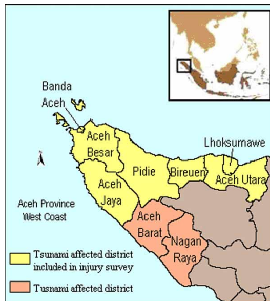
Figure 1. Tsunami-affected districts in Aceh, Indonesia.

The three surveys employed a similar design and survey instrument, but were conducted separately for logistical reasons. Displaced population estimates used for sampling were the best available to date, and relied heavily on information drawn from the UN Office for the Coordinator of Humanitarian Affairs (OCHA), HIC, and local government sources. 2 The March survey focused on the districts of Banda Aceh and Aceh Besar, with a population of 215,379 displaced persons. The July survey encompassed the East Coast districts of Pidie, Bireuen, Aceh Utara, and Lhoksumawe, with population of 152,348 displaced persons. The final survey was conducted in August in the district of Aceh Jaya, with a reference population of 40,422 displaced persons. In several cases, sub-districts were excluded because they were difficult to reach and reportedly had few internally displaced person (IDP) (one of six sub-districts in Aceh Jaya), or because permission from the local authorities could not be obtained (two of 40 eligible sub-districts in the East Coast survey area).