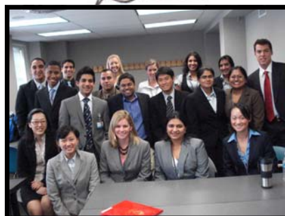
MHS CLASS OF 2010