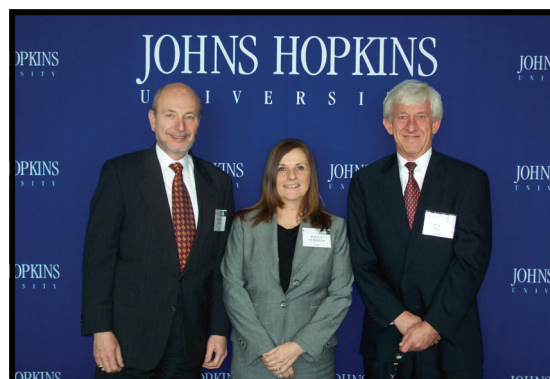
The Judges (from left to right)