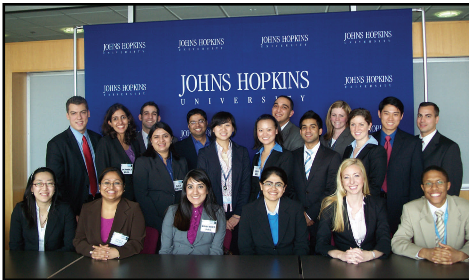
MHS Class of 2010 at the April 3, 2009 Case Competition

Based on the success of this year's experience, we will continue to sponsor this case competition each year.