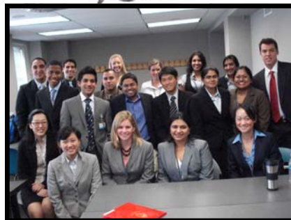
MHS CLASS OF 2010