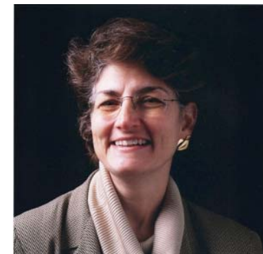
Linda P. Fried, MD, MPH

Association of age and sex with 5-year mortality in older adults, both with and without adjustment for other variables. Male sex remained associated with substantial mortality risk, compared with females, while age became less strongly associated with mortality, after adjustment for other demographic, disease, function, and behavioral characteristics. The height of the bars indicates the relative risk for each category.