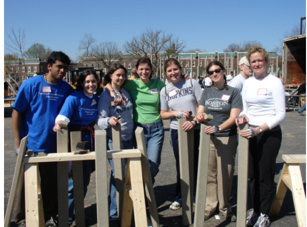
Photo: Students at the Spring Day of Service

TO SIGN UP: Email source@jhsph.edu with your name, email, phone number, and top 3 choices. Projects will be assigned on a first-come, first-served basis. SOM, SON, and JHSPH only!